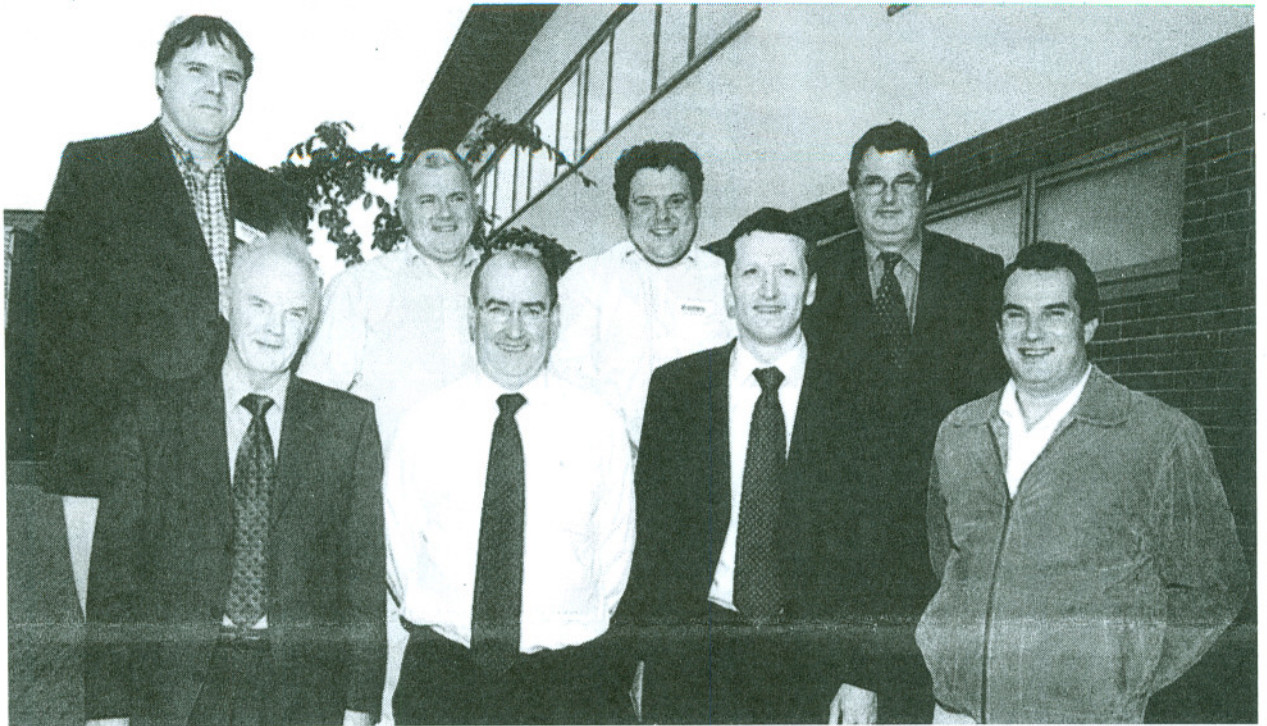
Members of The Midlands & West Enterprise Programme.